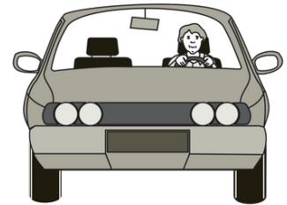
I can drive again