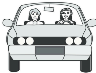
I need driving lessons