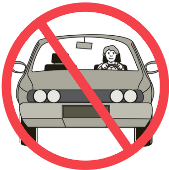
I cannot drive